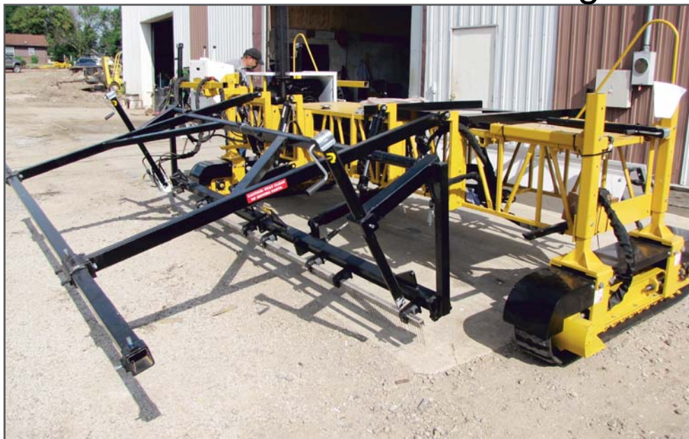
Optional Equipment (not included in base machine)