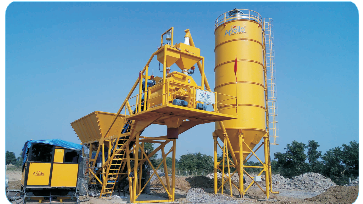
Compact Batching Plant : ATP 45, 61 & 75