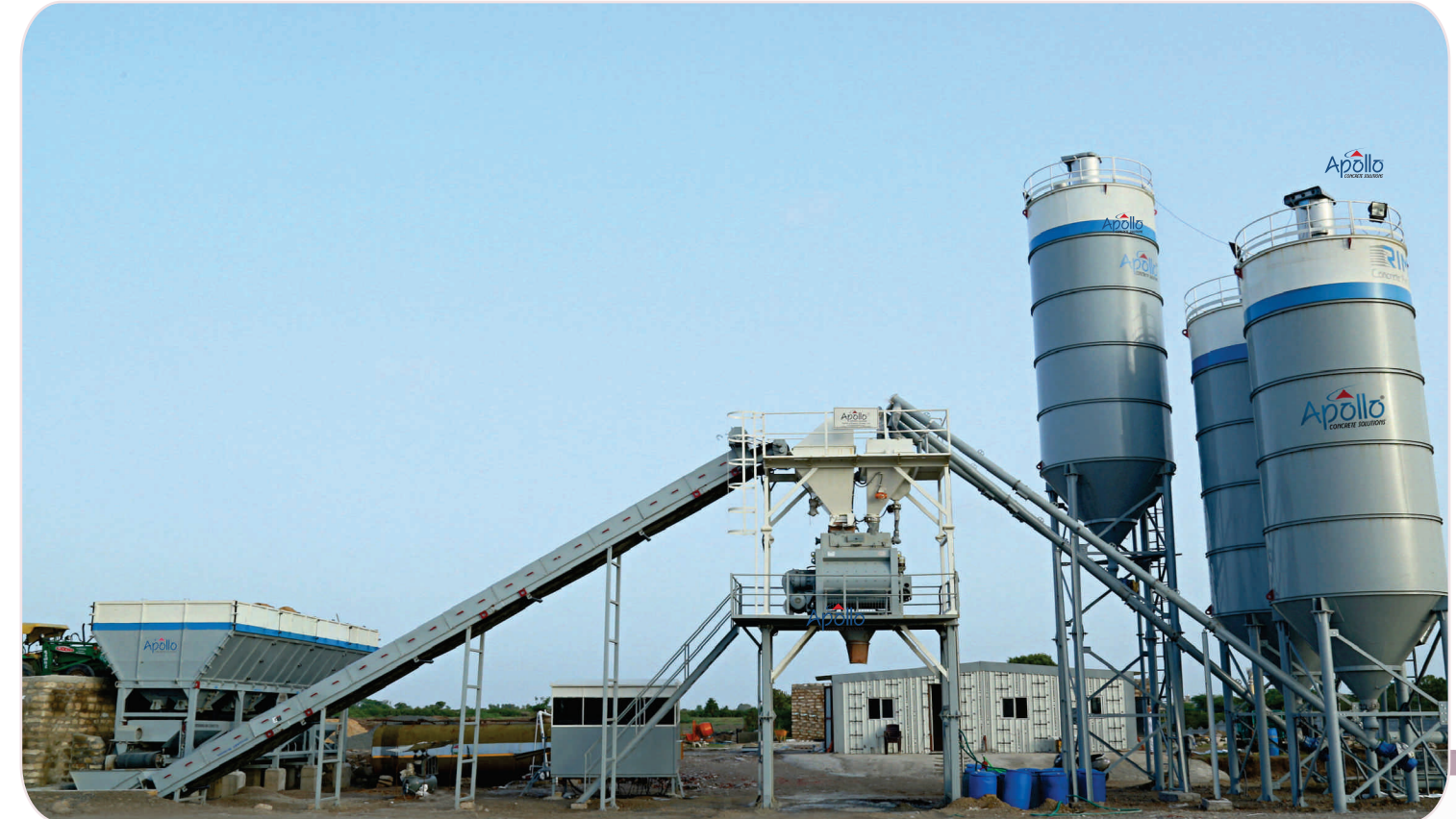
Concrete Batching Plant ATP 45/60/75